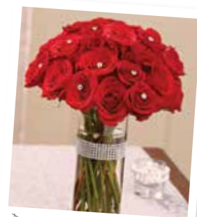
Diamonds and Pearls™