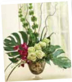
Part of Paradise Bouquet

The heart and soul of 1-800-Flowers.com has always been the retail flower shops that make up our network of BloomNet Professional Florists! Each day, BloomNet Florists from across the country create Truly Original floral arrangements and gifts for their customers, showcasing the local design talents and floral artistry of their shop. It's that local talent, artistry, and commitment to quality that keep local customers coming back into their shop!